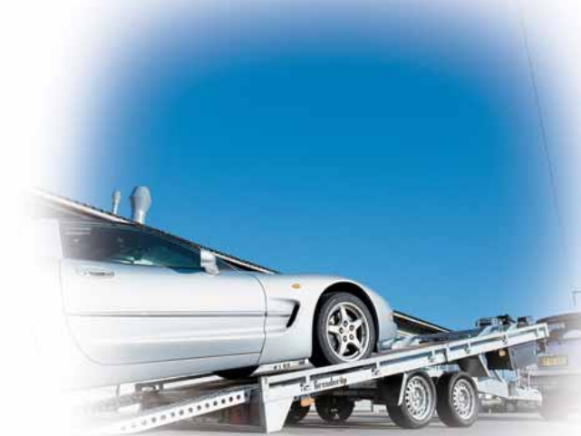
The series 6000 is equipped with 13" compact wheels which ensure a low loading height, a fine ramp angle, and very fine driving abilities.