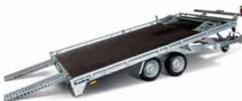
- shown with manual winch and wheel stop.