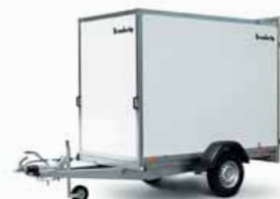
Also available with 150 and 220 cm internal height. *) Payload for trailers with doors - with ramp, see p. 6.