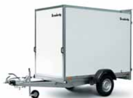
Also available with 150 and 220 cm internal height. *) Payload for trailers with doors - with ramp, see p. 6.