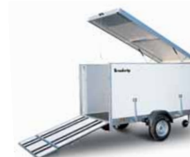
*) Payload for models with doors/ramp.