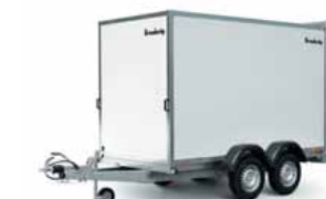
*) Payload with doors - payload with ramp see page 6. Also available with 220 cm internal height.

Brake lights The stoplight is integrated in the rearframe of the trailer. A safety feature in heavy traffic and can be easily seen from long distance.