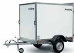
*) Payload for trailers with doors - with ramp, see p. 6.