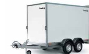
*) Payload with doors - payload with ramp see page 6. Several models, please see page 6.