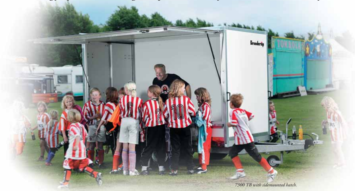
7300 TB with sidemounted hatch.

Being fully enclosed the Cargoliner protects the load from wind, weather and theft.