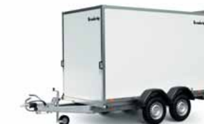
*) Payload with doors - payload with ramp see page 6. Several models, please see page 6.